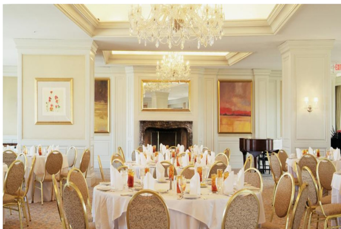
THURSDAY NIGHT—ROOFTOP DINNER

and of course the - INFAMOUS HUBNET DANCE