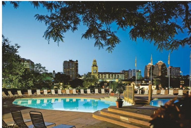
WEDNESDAY NIGHT—POOL PARTY REGISTRATION