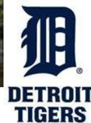
FRIDAY NIGHT—ROYALS vs DETROIT